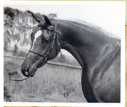
SF Bint Sonbolah (*Khofo++ x *Serenity Sonbolah)