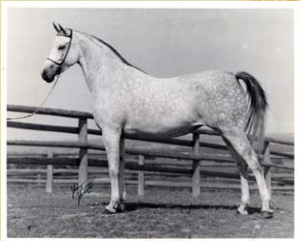
Serenity Sagda (Antar x Samia)