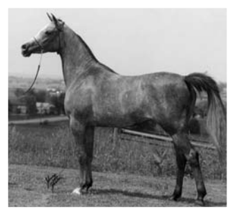
Serenity Bt Shahra (*Khofo++ x *Serenity Shahra)