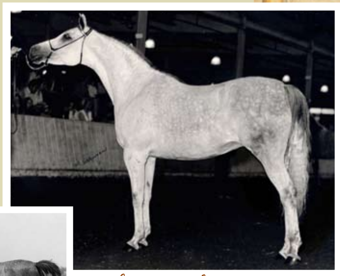
Serenity Shahra (Antar x Sheherezade)